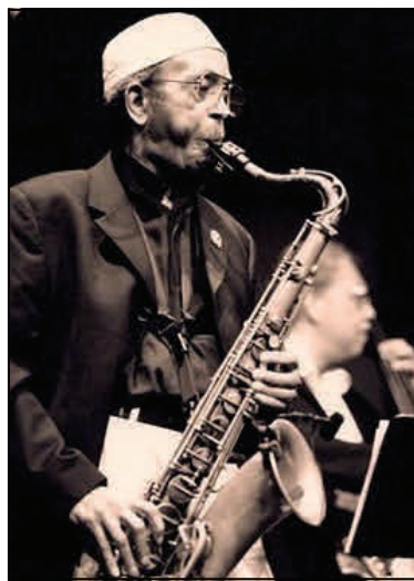
Just Jazz Artist of the Month tenor saxophonist Jimmy Heath